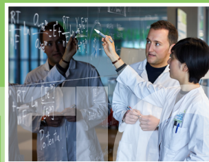
TRAINING ON THE SPECIFIC TECHNIQUES